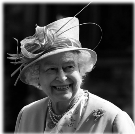
HM QUEEN ELIZABETH II